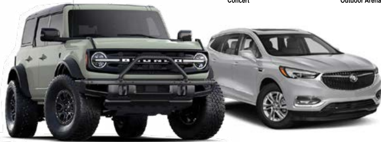
Family Owned & Operated Since 1955

PLUS THE BASIN'S LARGEST INVENTORY OF PRE-OWNED CARS, TRUCKS & SUVs