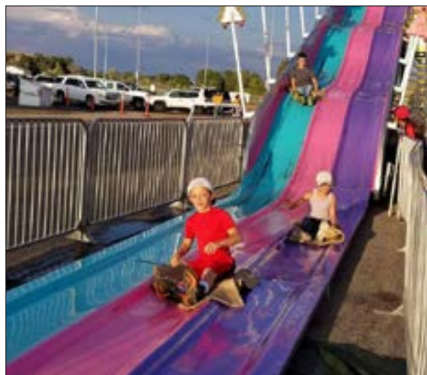
Phoenix Moon & Friends

Phoenix Moon & Friends will be performing live music throughout the event.