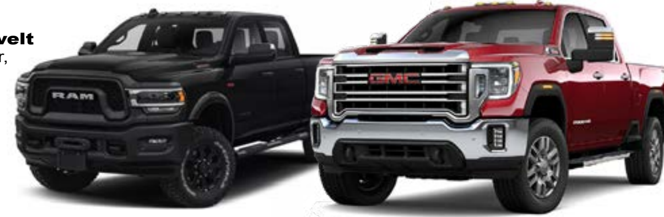
Family Owned & Operated Since 1955

L&L Motor Vernal GMC, Buick 463 E Main Vernal, UT 84078 435-789-2114