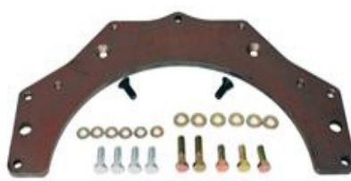
sample transmission adapter plate.